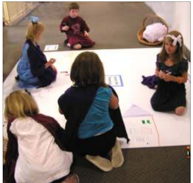
Children add their homes to the Habitat home wall