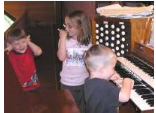
Music Makers and Music Friends choir children explore the sounds of the organ.

What do you think it must have been like to have been at the tomb when the followers of Jesus discovered that his body was not in the tomb? What would it have been like to have a messenger from God tell you that Jesus was not there... he was raised from the dead? What do you think it means for us today that Jesus is alive?